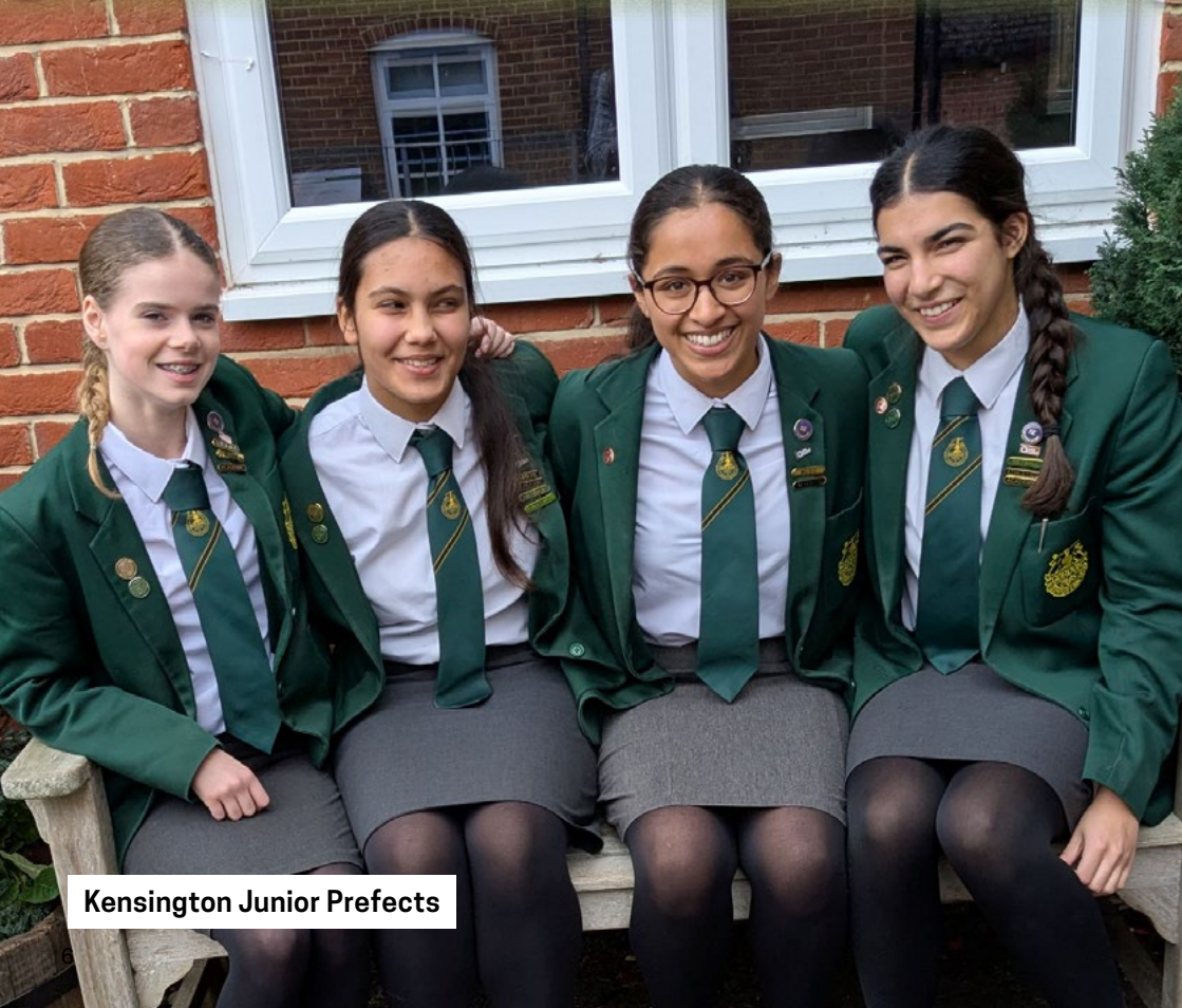
Kensington Junior Prefects