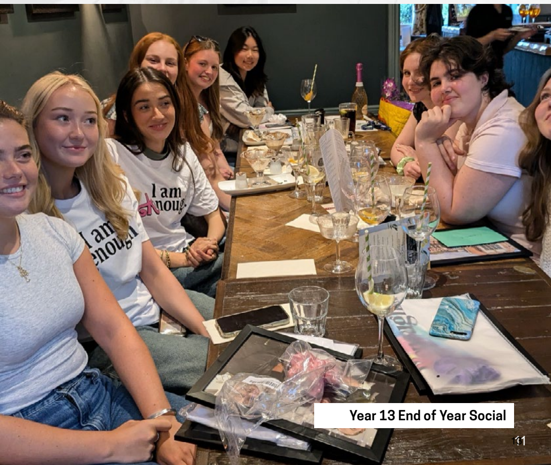
Year 13 End of Year Social

The House holds regular parties, trips and other social events. Within Kensington House we have "Families" made up of girls from all year groups which gives them an opportunity to mix and socialise with each other.