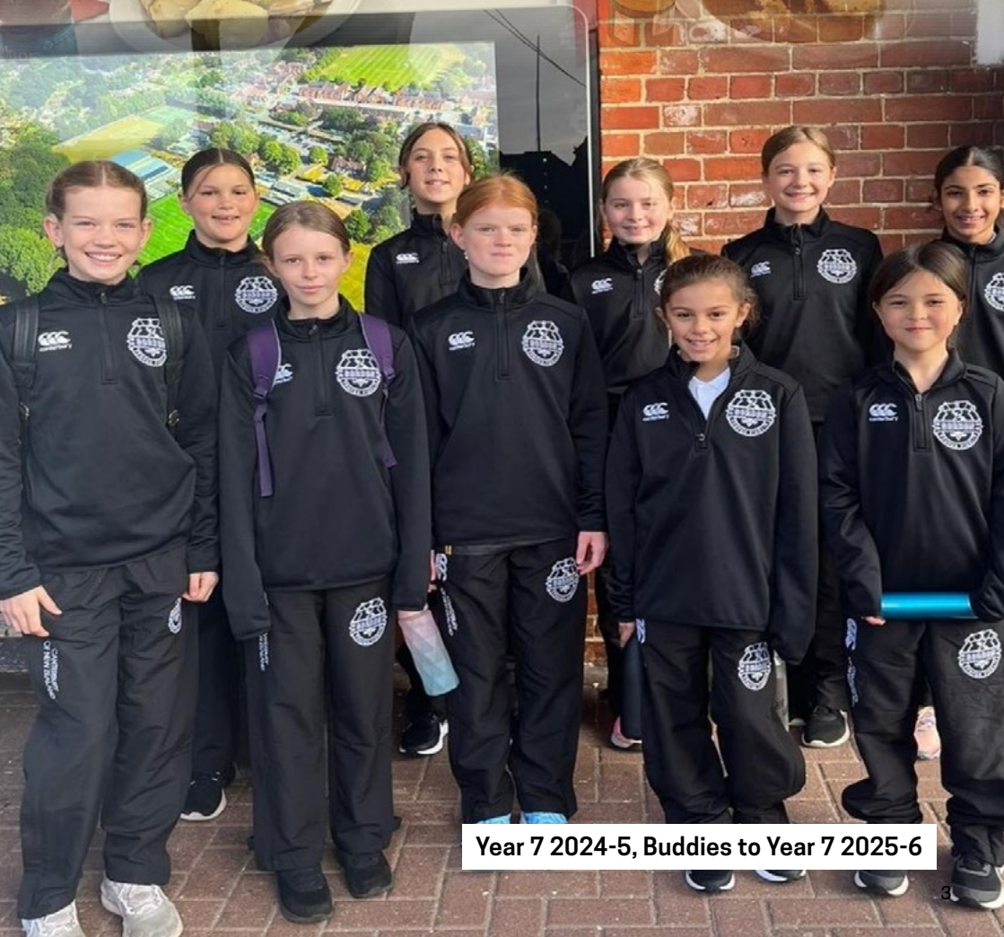
Year 7 2024-5, Buddies to Year 7 2025-6