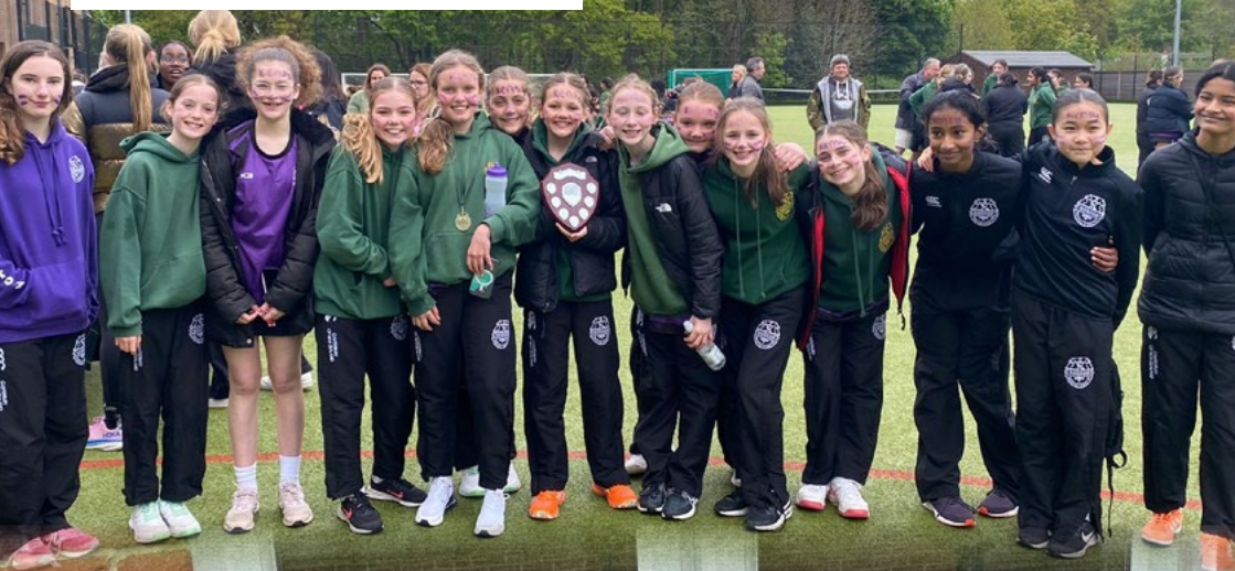
Year 8 Inter-House Netball Winners