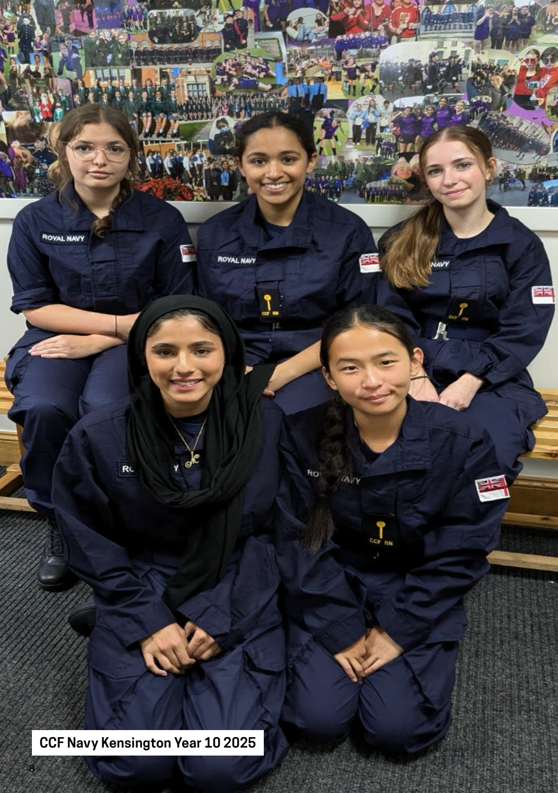
CCF Navy Kensington Year 10 2025