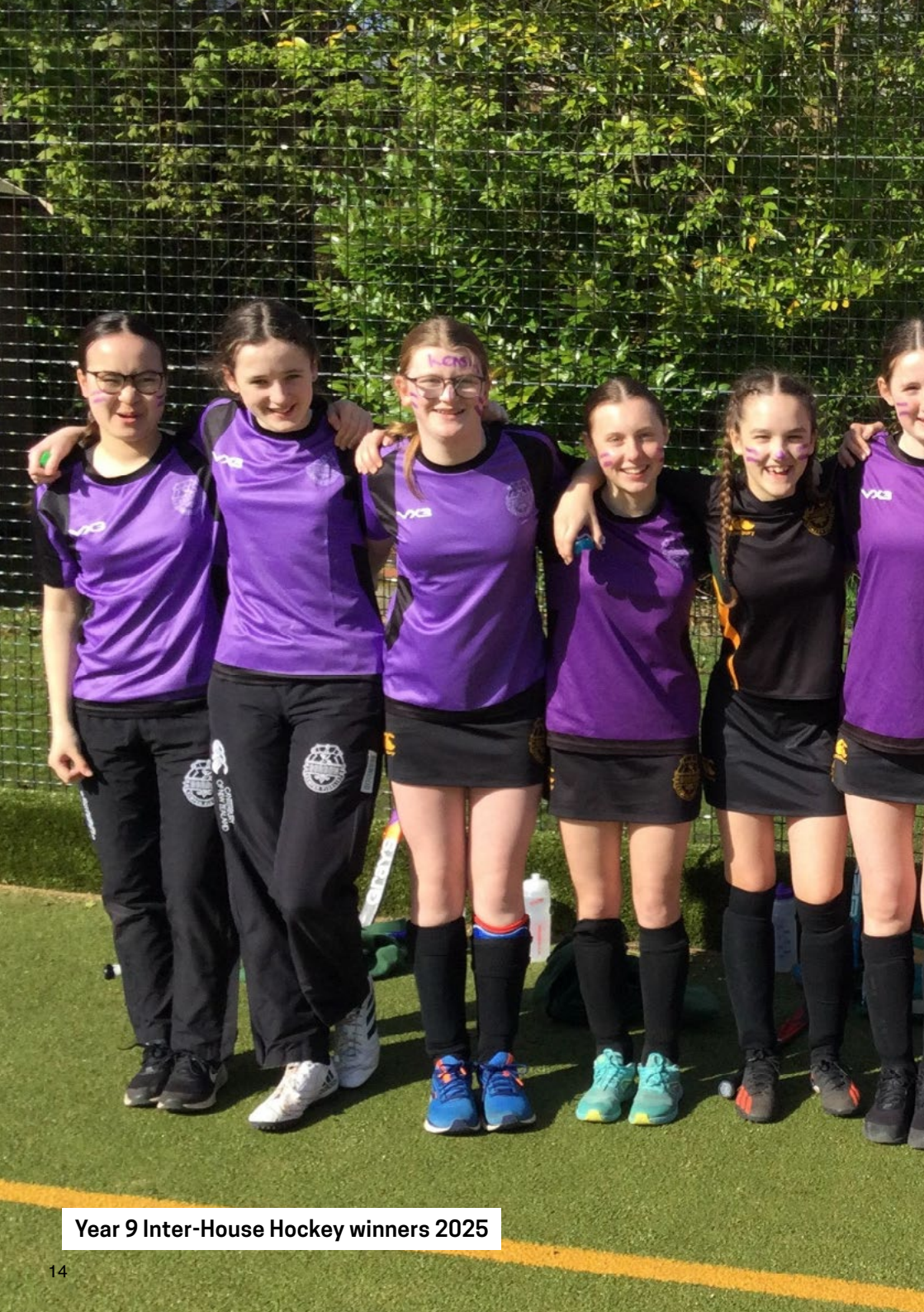
Year 9 Inter-House Hockey winners 2025