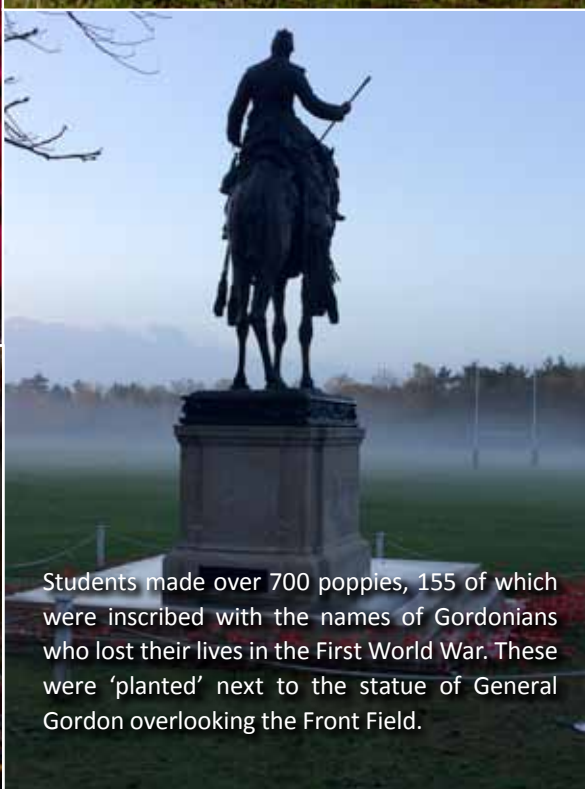
Students made over 700 poppies, 155 of which were inscribed with the names of Gordonians who lost their lives in the First World War. These were 'planted' next to the statue of General Gordon overlooking the Front Field.