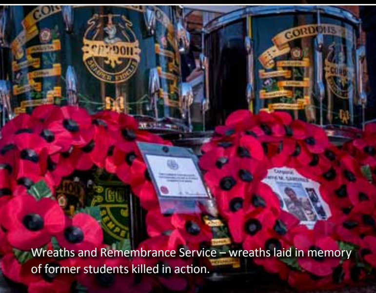
Wreaths and Remembrance Service – wreaths laid in memory of former students killed in action.