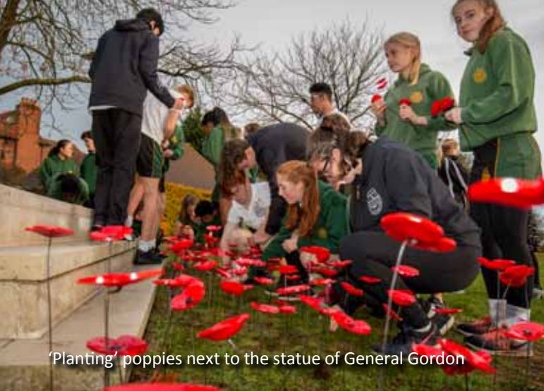
'Planting' poppies next to the statue of General Gordon