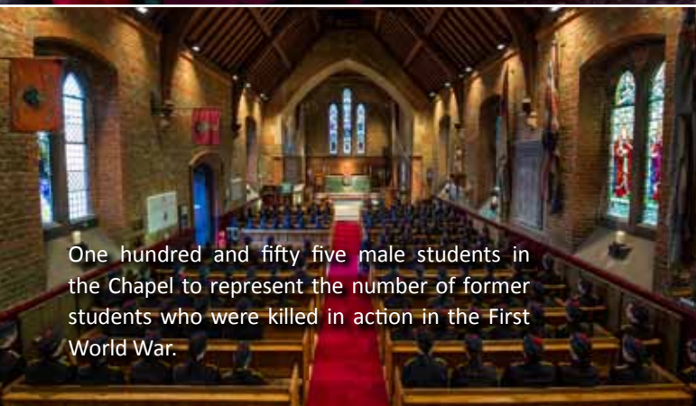
One hundred and fifty five male students in the Chapel to represent the number of former students who were killed in action in the First World War.