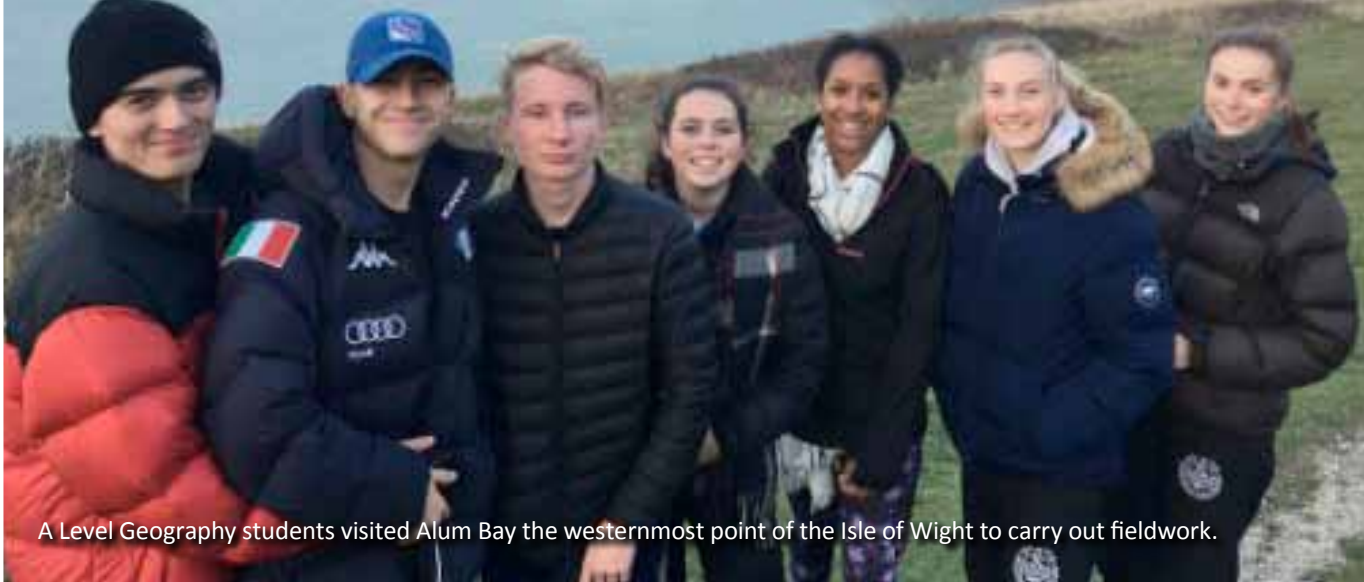
A Level Geography students visited Alum Bay the westernmost point of the Isle of Wight to carry out fieldwork.