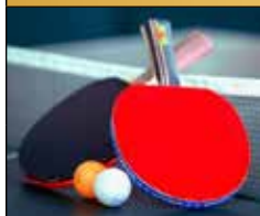
Table tennis will take place in the sports hall where all players beginners or established are welcome to learn or develop their skills.