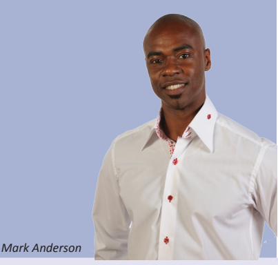
Careers Newsletter P1