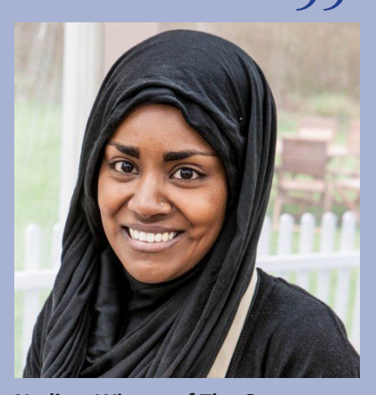
Nadiya; Winner of The Great British Bake Off 2015

I'm never going to put boundaries on myself ever again. I'm never going to say 'I can't do it'.